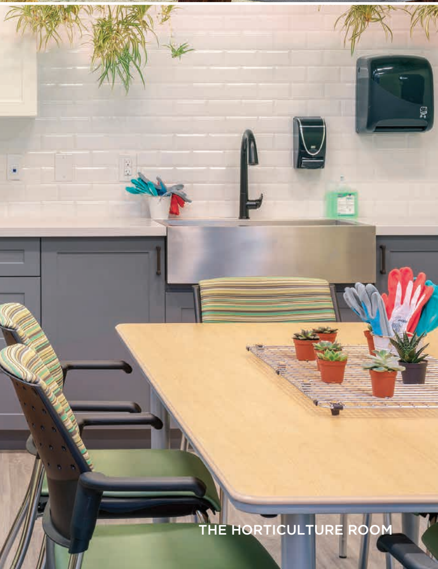
THE HORTICULTURE ROOM