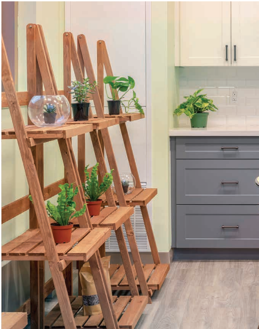
THE DOG WASH SPA