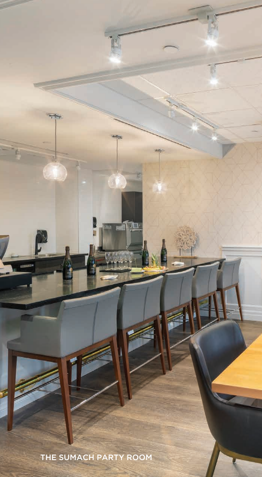
THE SUMACH PARTY ROOM

Find your own special place in one of The Sumach's many amenities, designed with you in mind. The billiards lounge is where you'll get in touch with your fun side.